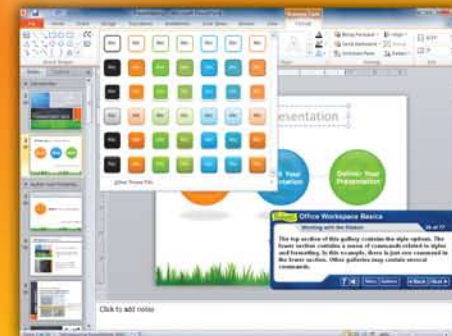
Learn new ways to create dynamic presentations for family, work, or personal projects.