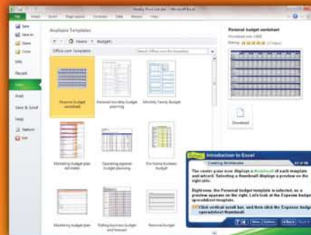
Find out how to easily create spreadsheets to manage budgets and track expenses.